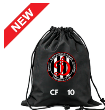
Club Drawstring Bag